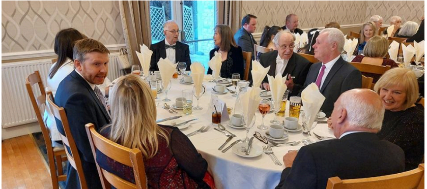
LAE Members and wives