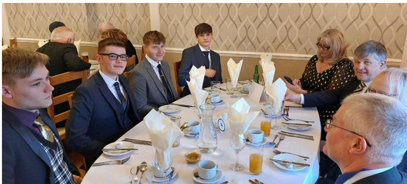
Presidents Table 2024 with our four new student Council Members

Members and wives of Keighley Association have also attended our Dinner and some of our Members attend theirs. All other organisations appear to have disbanded or no longer have dinners. We are therefore fortunate that we can continue to hold annual dinners.