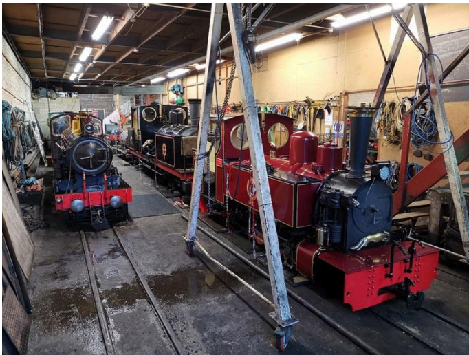
Inside the loco shed. Kirklees Light Railway, Clayton West Huddersfield.