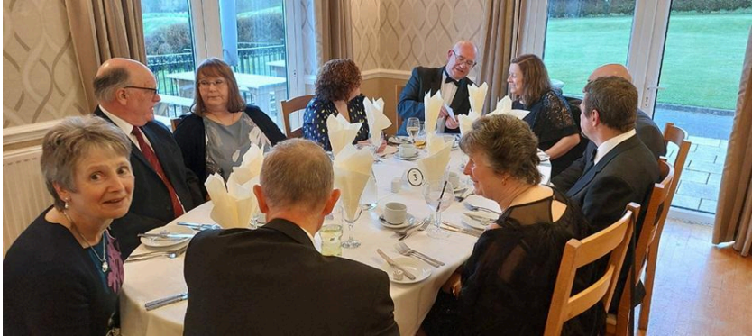
. Keighley Engineers Table