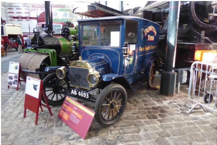
Model T Ford Van