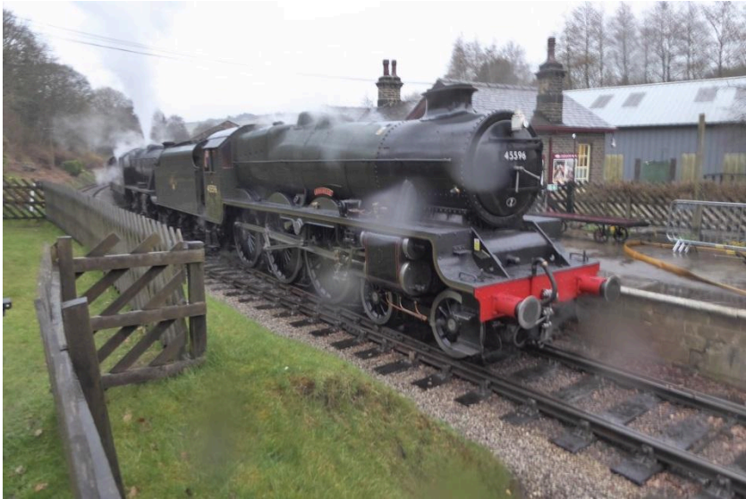
"Bahamas" in the rain at Oxenhope with 8F behind KWVR stem Gala March 2024