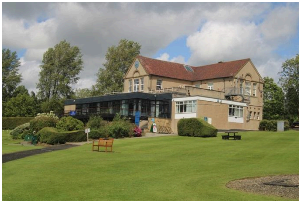
Cobble Hall Golf Club.